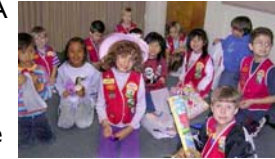
Our AWANA Kids

during the course of the meeting to accumulate the most points. The winning team wins a treat at the end of the club time. The AWANA program stresses the importance of regular Sunday School and AWANA Club attendance and gives awards for this. Awards are given primarily for achievement in the handbooks.