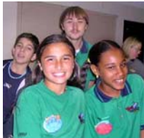
Our AWANA Youth

The FBC AWANA club program meets from 6:30 to 8:15 p.m. on Wednesday nights and currently serves age groups from 3 years to 18 years old (those in 12th grade). We have recently added the JV group (Middle School) and the Varsity group (High School). It is our goal to help you train your child to walk in God's path rather than those of the world.